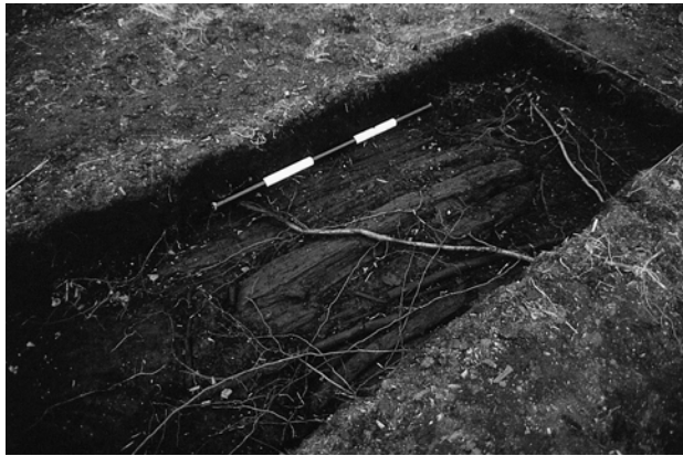
Figure 2. Trench 1 showing Betula roots.

although a 20 m wide strip was clear felled in the early 1990s. Crucial differences between the two sites are that the Sweet Track (3807/6 BC) is deeper within the peat substrate (0.46–0.94 m), it is below the water table and subject to a reducing or highly reducing environment (Brunner et al. , 2000).