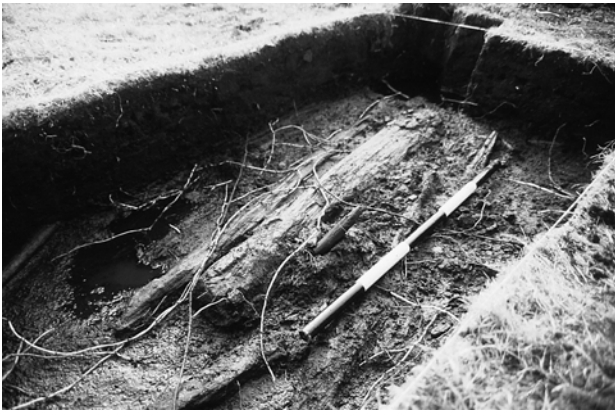
Figure 3. Trench 3 with the roots of Salix and Chamaenerion angustifolium .

Thin reddish-brown (maximum 3 mm) sinuous roots derived from Chamaenerion angustifolium (rosebay willowherb) and thicker roots from self-seeded Salix (willow) saplings were prolific in the contexts above the trackway (Figure 3). Both types of root had penetrated down through the peat to the timbers and some had grown into or through them. Salix roots were observed to pass directly through the wood while the Chamaenerion angustifolium roots grew into the wood following the direction of the grain.